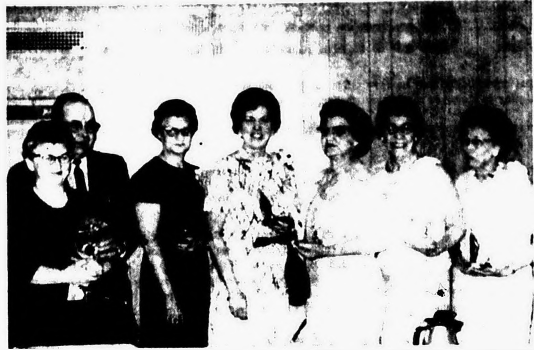
BALTZ'S BOWLING TEAM took first place for the third year in a row in the Tuesday night ladies league at Forrest. They tied with Harris Point for the top honor and in a bowl off held last Monday night they won two out of three games.